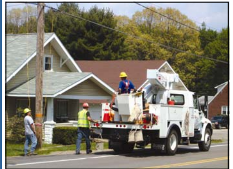
Above: Crews pull wires to connect the WAN.

From pulling wires to videoconferencing - the Wide Area Network is reaching our students!