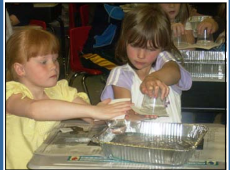
Above: Students in Redbank Valley School District participate in an Ann Arbor Hands-On Museum videoconferences.